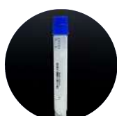
5.0ml External Thread