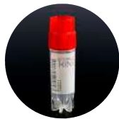
2.0ml External Thread