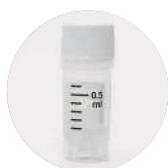
0.5ml External Thread