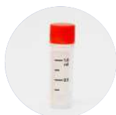
1.0ml External Thread