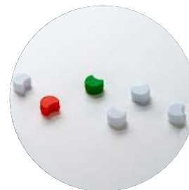
Inserts fit 2.0ml and 5.0ml vials' caps