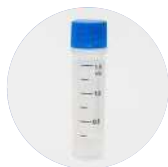
1.5ml External Thread