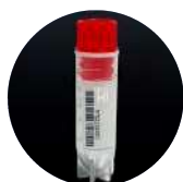
2.0ml Internal Thread